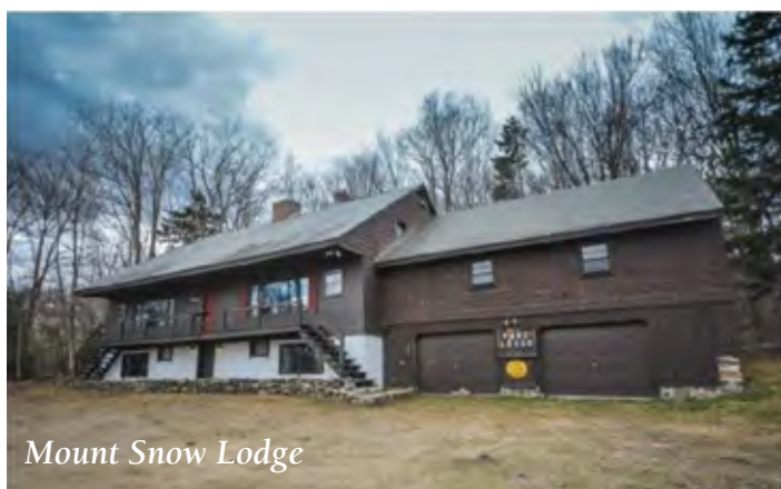
Mount Snow Lodge

THE GLEN ELLEN LODGE in Fayston, VT is on the access road to Sugarbush North (Mount Ellen) 500 yards past the Base Lodge parking area. The slopes are only 50 feet from the Glen Ellen Lodge and can be reached via a trail through the woods for true ski in/ski out access. Nightly rates are $35 per person per night. Contact the lodge reservationists at: glenellen@sterlingskiclub.org .